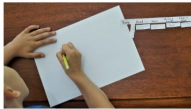
~ Draw your creature