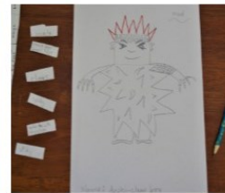
~ Add some colour