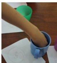
~ Lucky dip