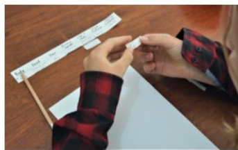
~ Reveal your 6 chosen features